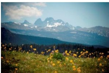
View of Big Horn Mountains