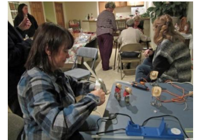
Members of Phi Chapter work on cowboy cookie cutters for the Northwest Regional conference.