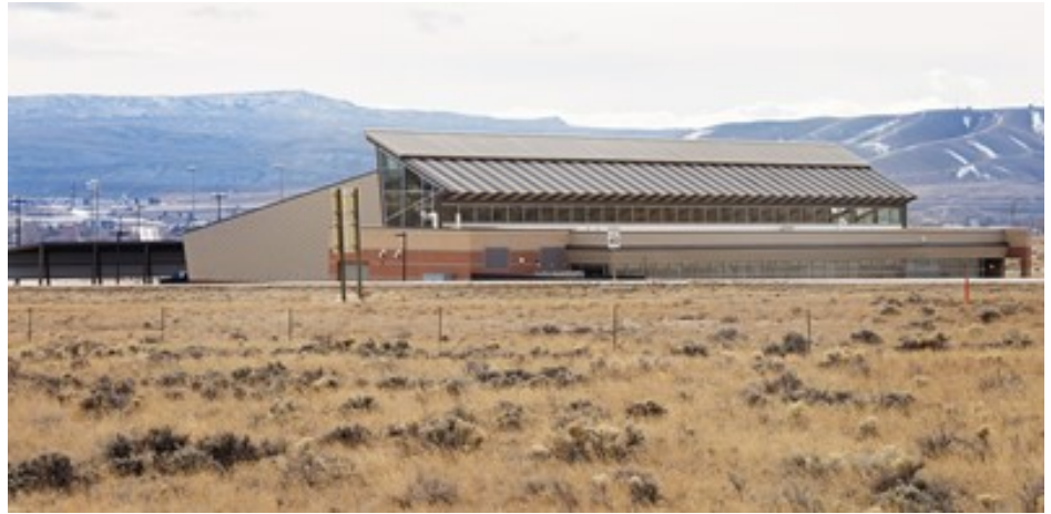
Convention activities will be held at the Carbon County Higher Education Center, 1650 Harshman in Rawlins. This career and technical center opened in the fall of 2014.

We would love to have you attend with your friends. This will give you the opportunity to have a great time and meet other outstanding women from all over Wyoming.