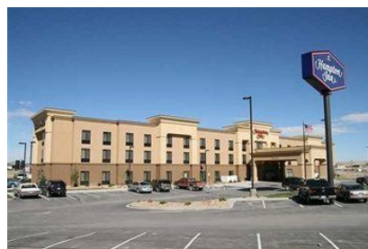
Convention attendees can stay at the Rawlins Hampton Inn, 406 Airport Rd.

Proceeds will go to the Society's Educational Foundation.