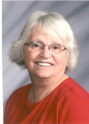
Nominee For First Vice President

law and three grandchildren. She especially enjoys traveling, golfing, cooking, and taking Zumba classes.