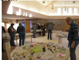
Kappa members work at the Jewelry Jamboree

winner. Members invited women from all educational areas to attend this annual event to purchase donated jewelry with the funds added to the scholarship fund. We commend our members for their dedication to projects that support literacy and education at all levels.