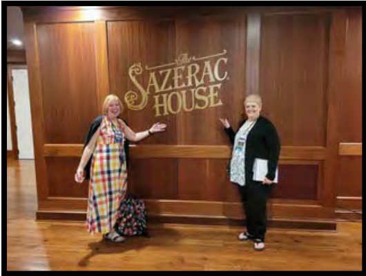
Time for Fun