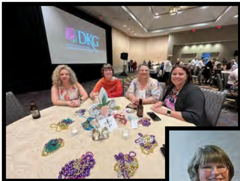
DKG Society Dinner