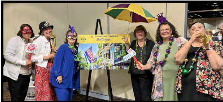
Wyoming members are ready for New Orleans.