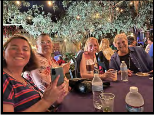
DKGIEF Event at Mardi Gras World