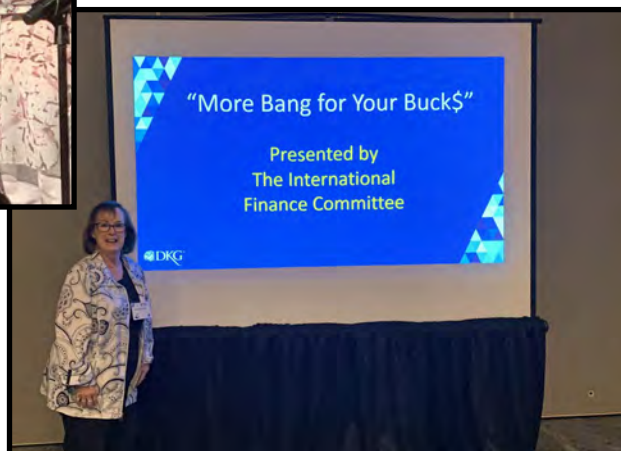
Glenda presents a breakout session for the International Finance Committee.