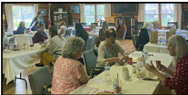
Kappa celebrates Founders' Day in May with a dinner and a special bingo game.