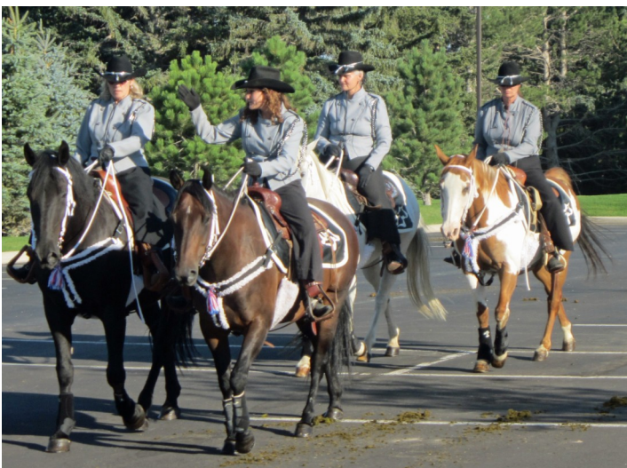
Cheyenne Trotters begin Wyoming Night in true western style with a cavalry routine in the east parking lot of Little America. Hands in Harmony, a choreographed sign language music group, Phil'n the Blanks, a family string band, and the Cheyenne Harmony Singers complete the evening.