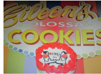
Frosted sugar cookies are the special Wyoming favor.