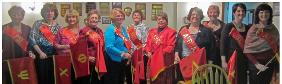
Alpha Xi chapter presidents are honored during the President’s Banquet.