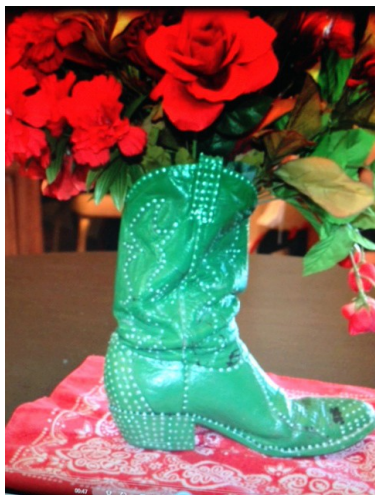
The popular green boot was center attraction in the registration area.