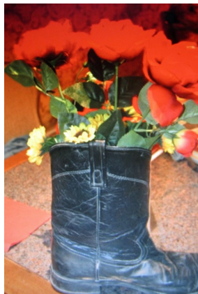
Boots filled with flowers adorned the tables showing the way to the Grand Ballroom.