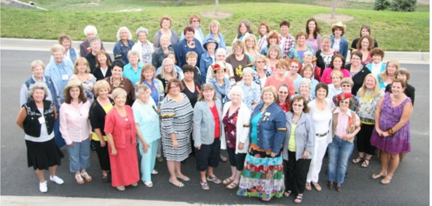
Many of the Wyoming members were able to be present for the official Wyoming picture taken outside at Little America Resort.