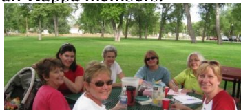
Kappa members gathered at Kendrick Park on a beautiful Wyoming summer day to plan for the upcoming programs.

Kappa Chapter has selected programs this year to include a program on political issues, women's breast health, and scoring of Wyoming Young Authors entries. The chapter will also hold its Jewelry Jamboree, where members donate and buy jewelry to fund our scholarship endowment at Sheridan College. A busy and productive year is anticipated by all Kappa members.